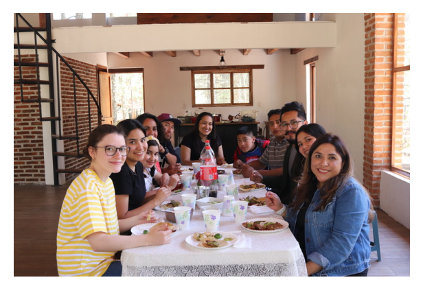
Several of our volunteers enjoying a meal together

She's doing a wonderful job making contact with different public authorities and using these contacts to get favor and the approval to continue with the project. We are believing the Lord for His help to get things moving forward soon again.