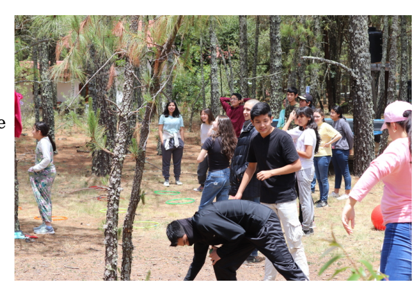
Playing games at camp

During the months of April and May we have made some good progress on our church's building project. However, due to some government interference, we've had to take a short pause again on the project. We've been trying to do everything correctly in terms of permits, but the state environmental agency came to inspect and temporarily stopped the project (due mostly to corruption and bureaucracy between competing government agencies). Sara has had to go almost weekly (some weeks daily) to different government offices to try to get things straightened out.